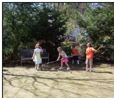
Marion Cross School kindergarten class "greening up" our yard.